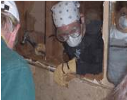
Remember the Gulf Coast

Since Hurricane Katrina struck in 2005, the generosity of Lutherans, through volunteer hours and donations, has been amazing. Now we ask you to join us in a renewed commitment to those who remain in great need. ( More )