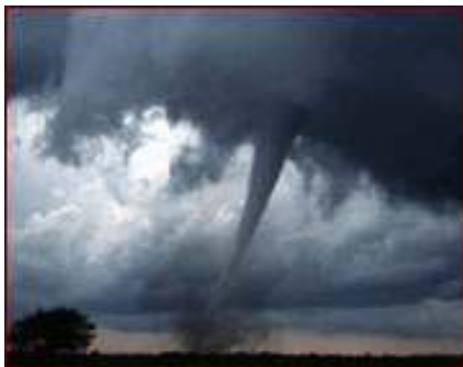
Winter Tornadoes in the US South

Since Hurricane Katrina struck in 2005, the generosity of Lutherans, through volunteer hours and donations, has been amazing. Now we ask you to join us in a renewed commitment to those who remain in great need. ( More )