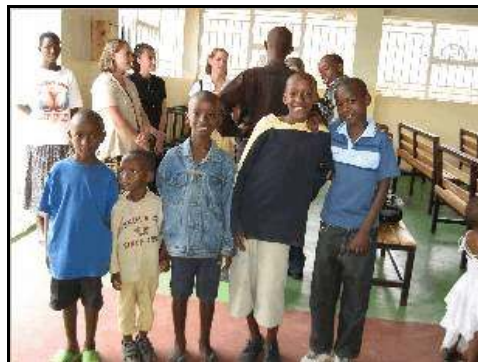
Some members of the Sunday School Choir at Kigali parish