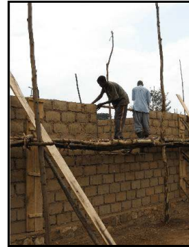
Building a secondary school dormitory (Support from St John's, Sacramento)