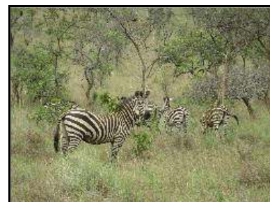
Akagera National Park