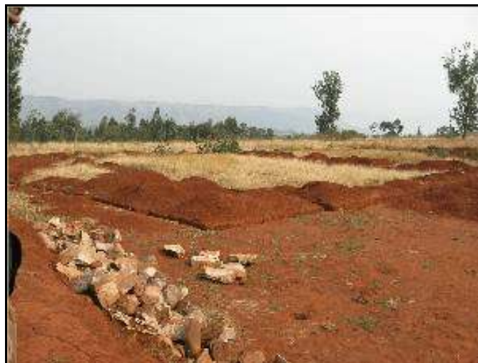
View of land cleared for the foundation of a future clinic at Mumeya