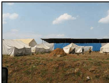
Refuge camp near the Tanzanian border