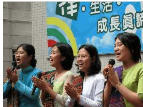
Above: Batak Students