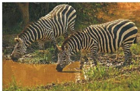
Akagera National Park