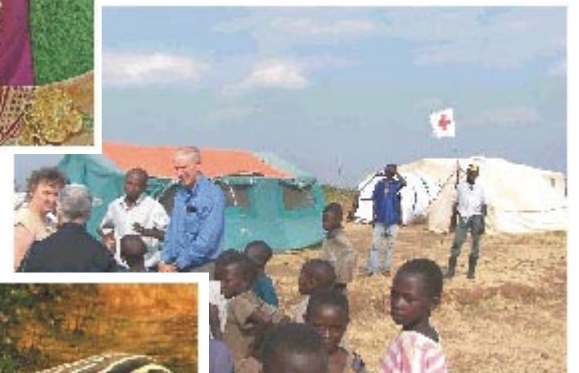
Kyanzi Refugee Camp