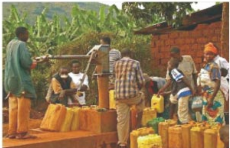
People walk many miles to collect water for home

Our Global Missions Advocacy Team will be hearing more from the delegation about the trip. Congregations interested exploring how to connect with a sister church, may call the Office of the Bishop at 510.430.0500 for information.