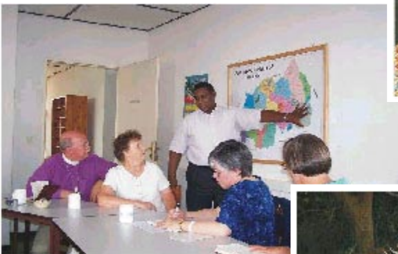
Getting a look at the map of the territory